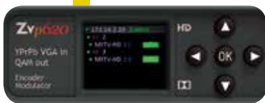
ZvPro600 Front Detail