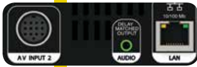
ZvPro600 Rear Detail