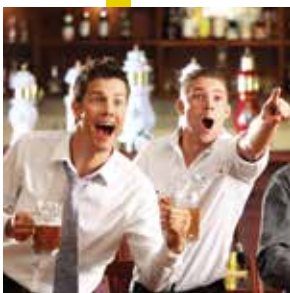
Restaurants, Pubs, & Bars