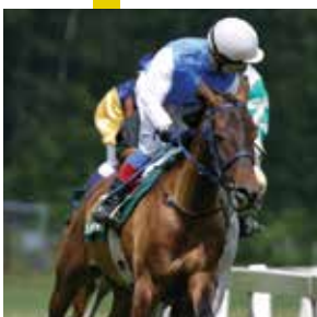
Casinos & Betting Shops