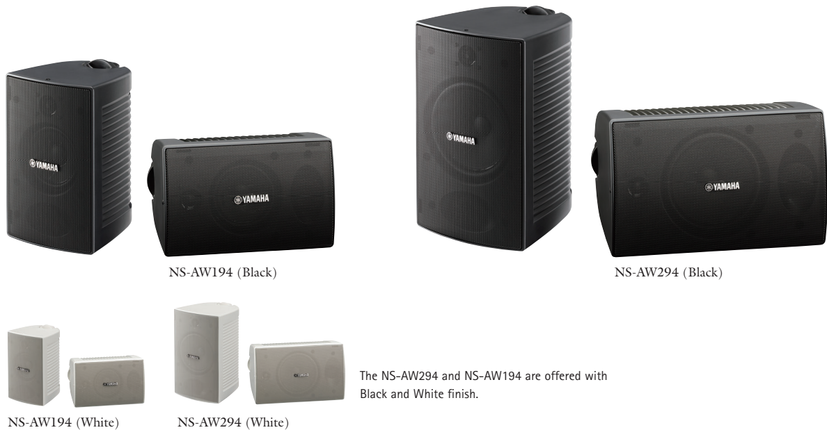
The NS-AW294 and NS-AW194 are offered with Black and White finish.

High performance outdoor speakers with outstanding sound quality and weatherproofing. The simple design allows them to be installed in many types of locations.