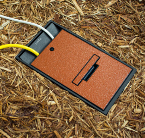
Outdoor Ground Box