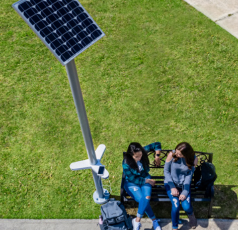
Solar Charging Kit