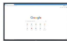
Extended screen (serve as the secondary screen to User's laptop)