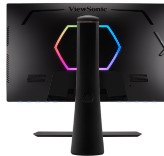
ILLUMINATE YOUR GAMING SETUP Elite RGB Lighting System