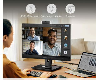
CRYSTAL CLEAR MEETINGS