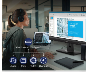
LESS CLUTTER. MORE EFFICIENCY. One cable solution