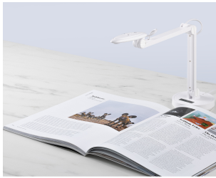
MAKE DOCUMENT VIEWING EASY WITH INTUITIVE CONTROLS