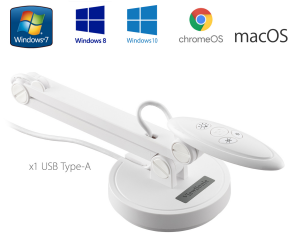
CONNECTIVITY AND COMPATIBILITY