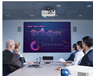
CRYSTAL CLEAR IMAGES In bright environments