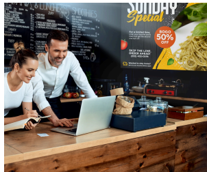
4,500 ANSI LUMENS And WXGA resolution