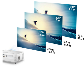
IMAGE SIZE AND PROJECTOR DISTANCE