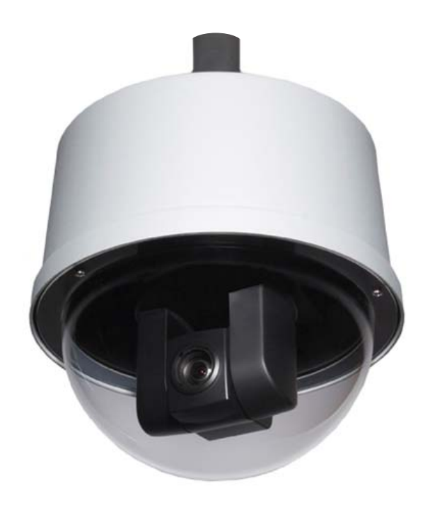
12" Indoor Pendant Mount Dome (with Clear Optical-Grade Dome (shown with 1.5" NPT Pipe and HD-18 Camera - Camera Not Included)

The DomeVIEW HD Series Domes are an excellent way to securely mount Vaddio PTZ cameras for a wide range of HD video applications.