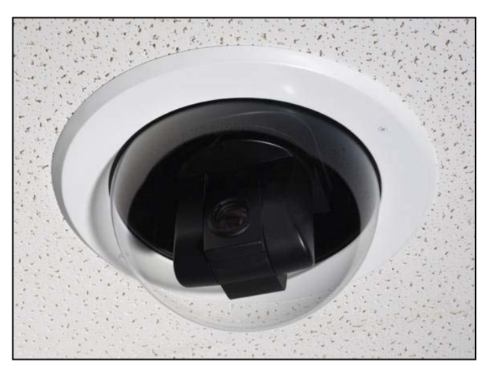
Image: 12" Indoor Flush Mount Dome Enclosure with Clear Optical-Grade Dome for the Vaddio HD-18/19/20/22/30, HD-USB and RoboSHOT Camera Systems.

The Flush Mount Dome comes with a heavy-duty tile support brace to keep any tile from sagging, a white spin-form trim ring for depth and dimension with white cosmetic attachment screws.