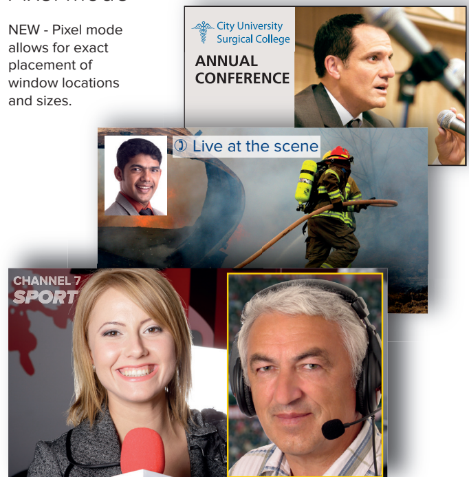
Picture-in-Picture capability - any size, any position