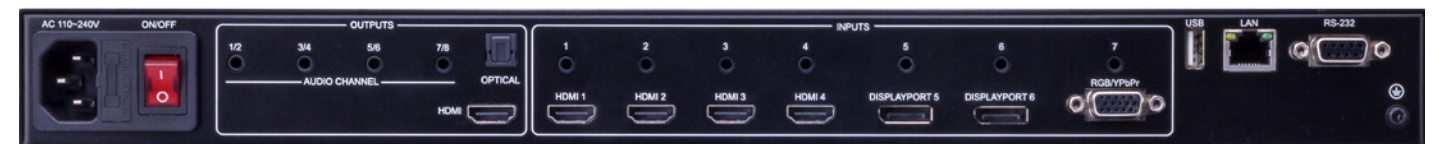
Its deceptively simple appearance disguises its extremely powerful abilities as a 4K Multiviewer / Presentation Switcher.