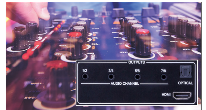
Embed / de-embed any of the 7 audio inputs