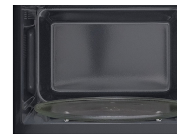
Stylish Gray Interior

With decades of experience designing innovative cooking appliances, it's easy to see why home cooks throughout the world trust Sharp Carousel.