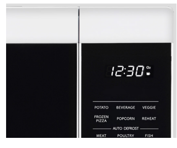
Premium White LED Display is Easy to Read