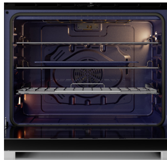
The hidden bake element and sculpted floor of the modern, cobalt blue porcelain interior makes cleanup a breeze.