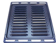
Broiler Pan / Grid

Product specifications and design are subject to change without notice.