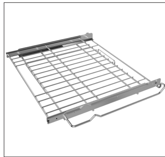
The included glide-rack allows for removing even the heaviest dishes