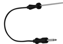
Meat Temperature Probe