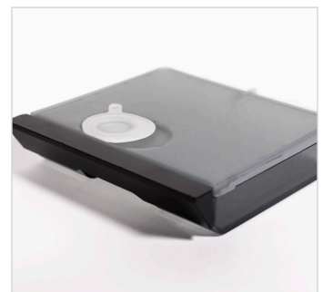
The compact, removable 24 oz. water tank is lightweight, easy to fill, and convenient to access.

SHARP ELECTRONICS CORPORATION 100 Paragon Drive, Montvale NJ, 07645 1.800.237.4277 • www.sharpsusa.com