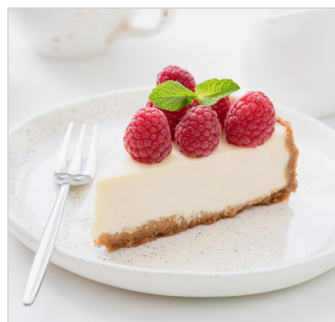
Steam Bake Water Bath is for creamy desserts, like cheesecake, without the hassle of handling hot pans of water.