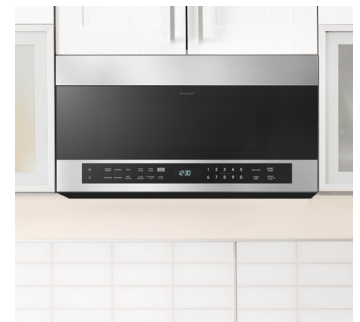
The sleek edge-to-edge stainless steel and black glass design is an elegant look to your kitchen

Product specifications and design are subject to change without notice.