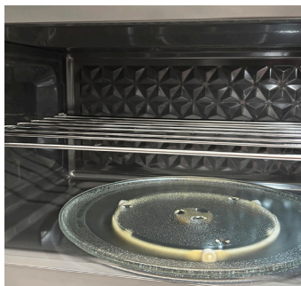
Included Grill Rack for convenient 2-Level Cooking

With decades of experience designing innovative cooking appliances, it's easy to see why cooks around the world trust Sharp.