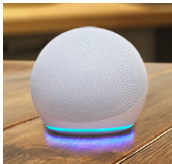
Works with Alexa allows for effortless verbal control over your microwave