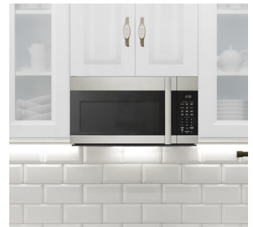
The sleek edge-to-edge stainless steel and black glass design is an elegant look to your kitchen

Product specifications and design are subject to change without notice.