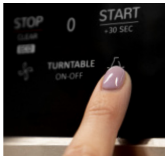
Premium LED Interior and Cooking Surface Lighting