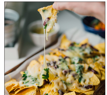
Melt/Soften feature to quickly melt butter, soften ice cream, and warm syrup