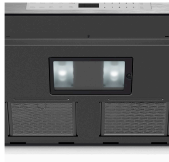
Easy-to-access, sliding grease filters allow for effortless, hassle-free replacement