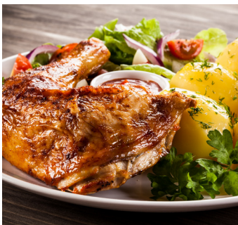
Generous, 1.4 cu. ft.* oven makes it easy to reheat larger dishes

The powerful, 2-speed ventilation system is effective up to 300 cu. ft. per minute (300 CFM) and can be configured to ducted venting or ductless recirculation. The SMO1461GS also features easy-to-reach, easy-to-replace charcoal, and grease filters. With decades of experience designing innovative cooking appliances, it's easy to see why cooks around the world trust Sharp.