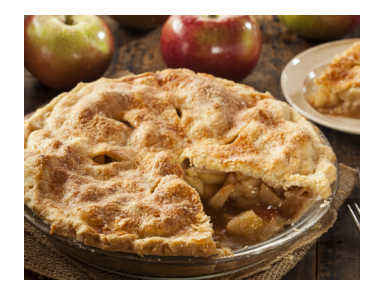
Utilize Low Mix or High Mix to Incorporate Both Convection Heat and Microwave Cooking

With decades of experience designing innovative cooking appliances, it's easy to see why home cooks throughout the world trust Sharp Carousel.