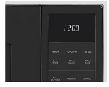
Premium White LED Display is Easy to Read