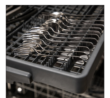
The wide and deep third rack is ideal for flatware and serving instruments such as spatulas and other baking utensils