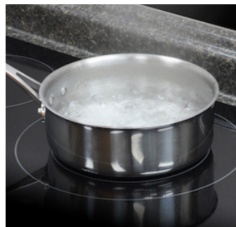
Simmer Enhancer precisely holds the temperature for extraordinarily consistent simmering.