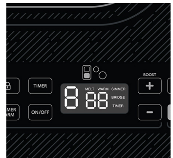
Bright white LED controls make the touch glass clear and easy to read.

SHARP ELECTRONICS CORPORATION 100 Paragon Drive, Montvale NJ, 07645 1.800.237.4277 • www.sharppusa.com