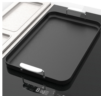
The SCH3043GB offers a bridge element for oblong pans and longer cookware.