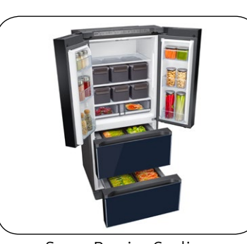
Super Precise Cooling