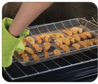
Air Fry - Tray Not Included

Fingerprint Resistant Stainless Steel (shown)