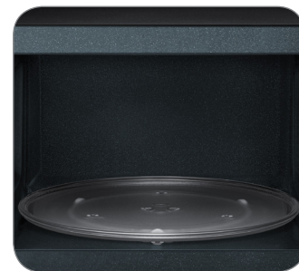
Ceramic Enamel Interior