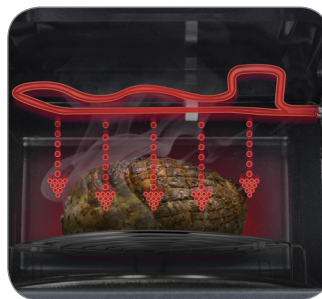
Grilling Element with Ceramic Plate