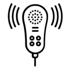
Integrated Pillow Speaker Interface

Provide your patients with an entertainment experience that makes it feel more like home. Equipped with a pillow speaker interface, Samsung's HCU7030 Series Crystal TV enables clear streaming audio, right at the patient's bedside. The displays are UL-certified for installation in a variety of spaces in a hospital or healthcare facility.