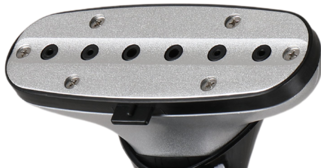
Heavy duty aluminum plated steam nozzle