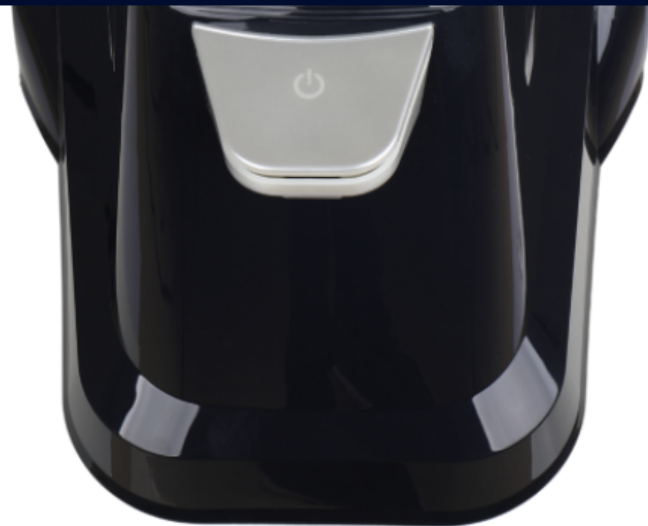
Foot Pedal Power Control