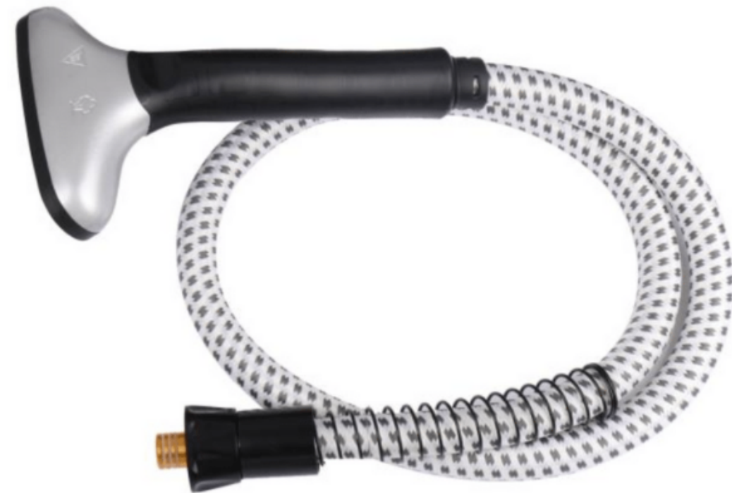
Dual-insulated Woven Hose w/ Brass Connector