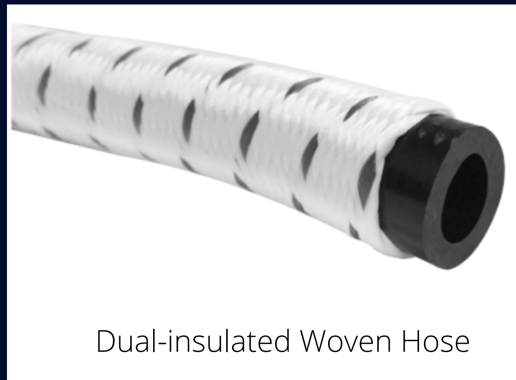
Dual-insulated Woven Hose