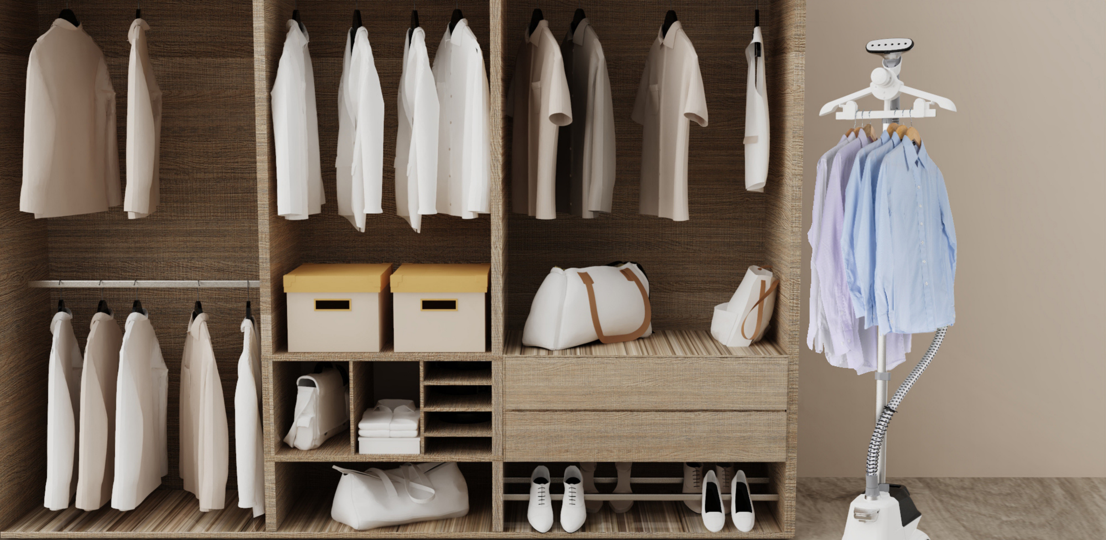
SALV X3 COMMERCIAL FULL-SIZED GARMENT STEAMER