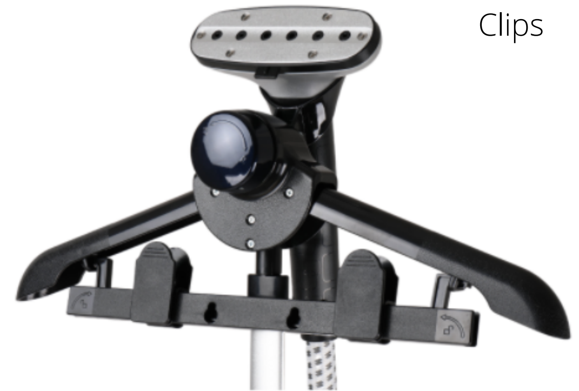
360 degrees Swivel Hanger with Hanger Clips