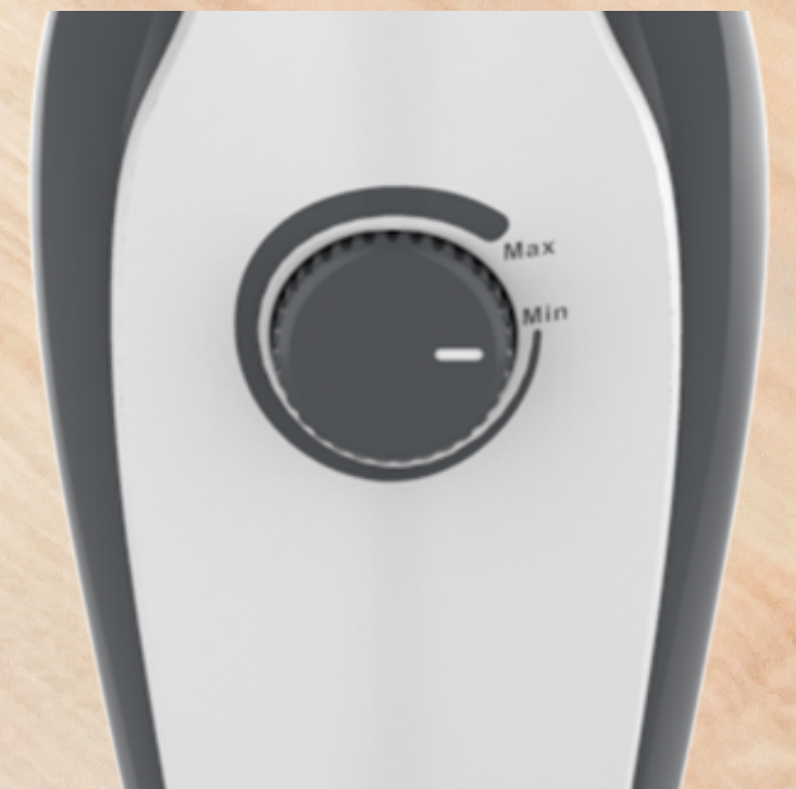
EASY TO CONTROL STEAM SETTING KNOB