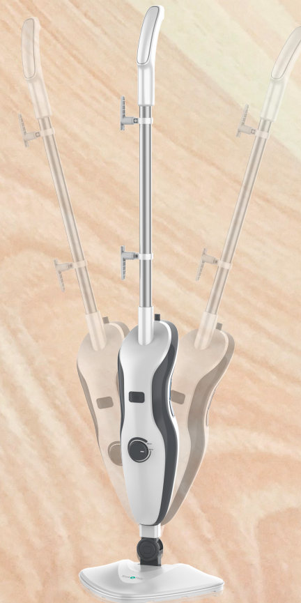
SWIVEL MOP HEAD