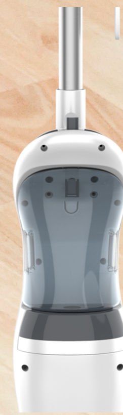
TRANSLUCENT WATER TANK & WATER FILTER