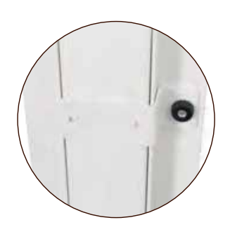
ACADIA : Delivered with possibility of fixing by drilling for public places