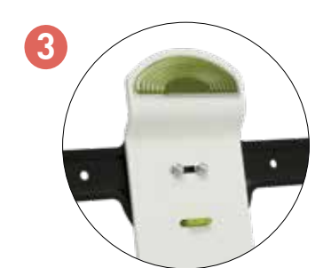
Stabilizing Pad (made of elastomer)