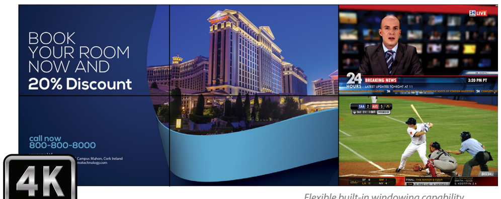
Flexible built-in windowing capability

position sensors built into the LCD that determine its location within the array and scale the sources across the video wall automatically, saving hours of set-up time. Planar Big Picture Plus processing also allows ultra-high resolution content, up to 4K, to be spread over multiple displays at native resolution. For more complex configurations, Clarity Matrix supports all leading image processing and digital signage software solutions including the Clarity® Visual Control Station™ (VCS™) Video Wall Processor and Planar® Indisys® Video Wall Processor.