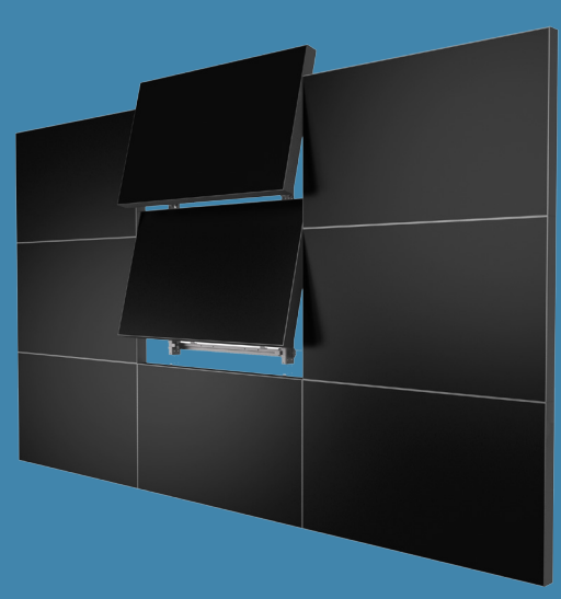
Clarity Matrix Service Mode for in-wall servicing

With Clarity Matrix, designing, installing and servicing an LCD video wall has never been easier. The architecture supports integrated video and power extension up to 500 feet (152.4 meters) eliminating compatibility and integrity worries and costs associated with long-distance cable extenders and AC power outlets behind the video wall. Fewer cables are necessary to run to the video wall, simplifying and reducing the cost of the system.