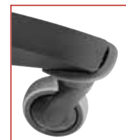
Corner bumpers protect walls and doorways from damage