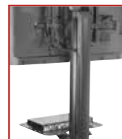
Cable management allows cables to enter or exit anywhere along the column