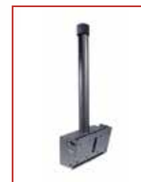
Dedicated model with 1.5" NPS Coupler, PLCK-1 (Display adaptor sold separately)