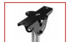
Ceiling Plate Cathedral Accessory, MOD-CPC