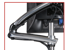
Cable management keeps a clean appearance