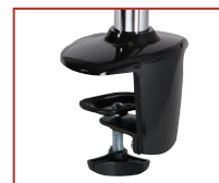
LCT620A's Clamp on base easily clamps to edge desk or counter top