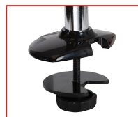
LCT620A-G's Grommet base works with through holes in the desk or counter top