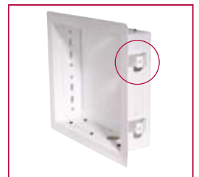
Stud locating tabs