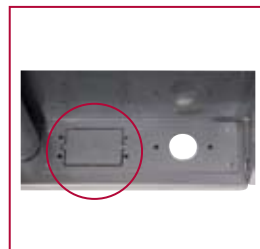
Removeable outlet receptacle