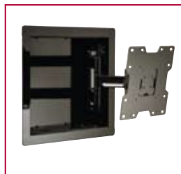
Compatible with PA730, PA740, PP730 & PP740, sold separately

Easily install an outlet with a built in removable outlet receptacle