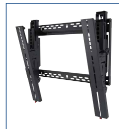
Fully adjustable +15/-2° tilt with IncreLok™