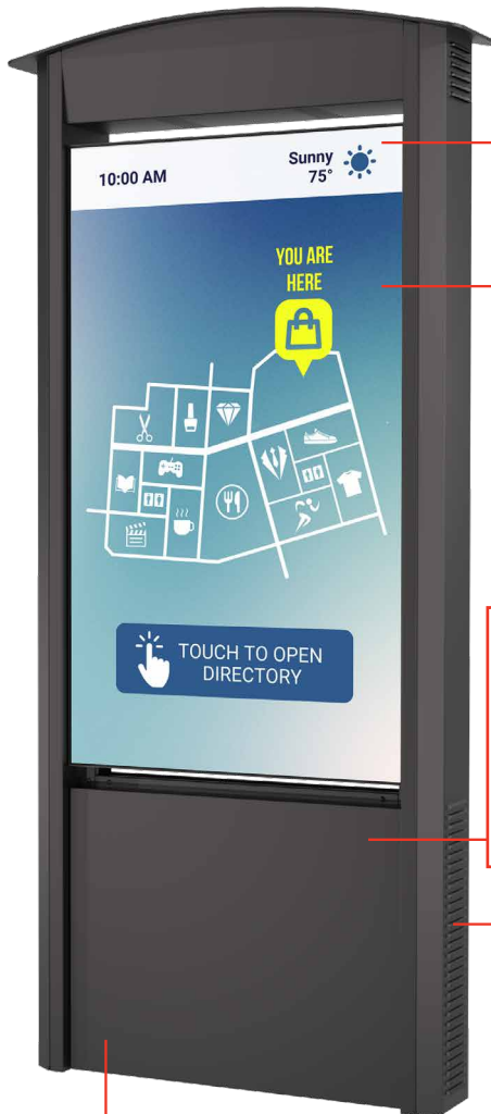
Model Shown: KOP55XHB

Upgrade your current signage with a brand new Peerless-AV® Smart City Kiosk. This next generation Smart City Kiosk will allow you to replace dynamic, digital content quickly, easily, and remotely, drawing in more engagement than your previous static signage. By combining a sleek, modern aesthetic with an approachable and easy-to-use design, the Smart City Kiosk puts functionality at the forefront. A 10-point IR touch overlay can also be added for an interactive customer experience. Outdoor elements are no match for this kiosk because it is all-weather rated, highly durable, and built to last. Maintenance and installation are also simplified with no cranes or forklifts needed and secure rear doors that allow quick access to the display for maintenance purposes. The Smart City Kiosk comes packed with ample component storage and a 55" Xtreme™ High Bright Outdoor Display with full HD1080p resolution. Even when placed in direct sunlight, you are guaranteed a bright and crisp picture when sharing digital signage content - Whether that is focused on travel, wayfinding, advertising, weather, entertainment, and more.