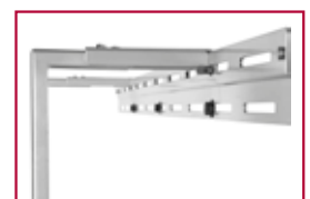
Depth Adjustable Safety Lock