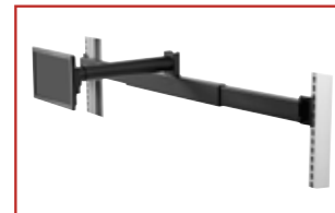
Portrait and landscape orientation - DB10D not included