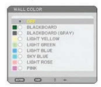
On a green wall...

These provide for adaptive color tone correction to display properly on non-white surfaces.