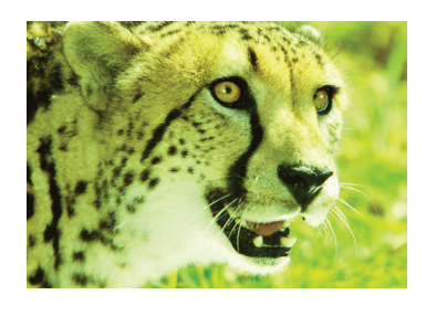
BEFORE auto wall correction