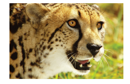
AFTER auto wall correction