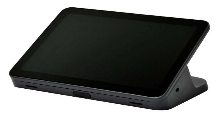
Mimo Myst Link