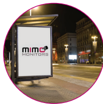
Public advertising & messaging for any venue