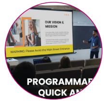
Awards, sports, or special announcements