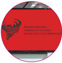
Weather watches and warnings