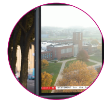
Branding across campus displays