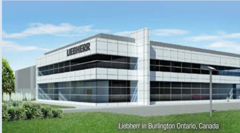
Liebherr in Burlington Ontario, Canada

Liebherr – A world leader in premium refrigeration