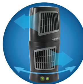
Pivoting Top Module for Precision Air Delivery