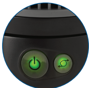
Front-Mounted Controls 3 Quiet Speeds