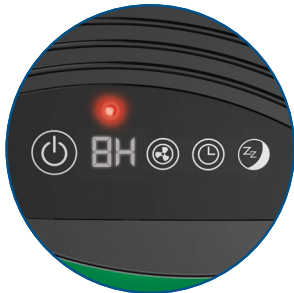
4 Speeds, 8-Hour Timer DreamMode™ Auto Check Filter Reminder