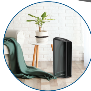
Ideal For Rooms Up To 232 ft²