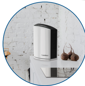
Ideal For Rooms Up To 109 ft²