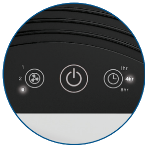
3 Quiet Speeds, 8-Hour Timer Auto Check Filter Reminder