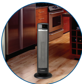
1500 Watts of Comforting Warmth