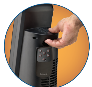
Easy-Grip Carry Handle On-Board Remote Storage