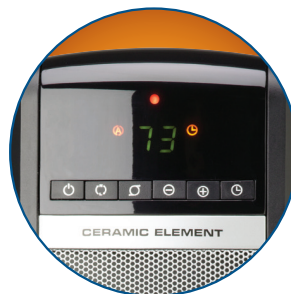
Easy-to-Use Comfort Select® Controls Adjustable Thermostat 8-Hour Auto-Off Timer