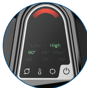
Easy-to-Use Electronic Controls Adjustable Thermostat 2 Quiet Heat Settings