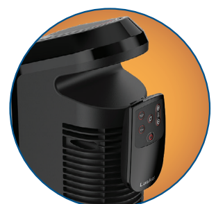
Easy-Grip Carry Handle On-Board Remote Storage