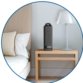
1500 Watts of Comforting Warmth