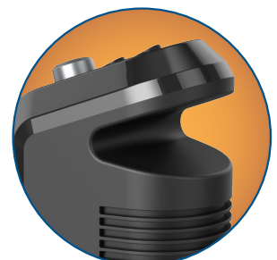
Easy-Grip Carry Handle