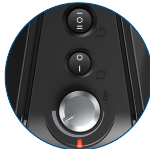
Easy-to-Use Controls Adjustable Thermostat 2 Quiet Heat Settings