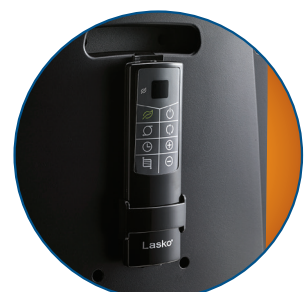
Easy Carry Handle and On-Board Remote Storage