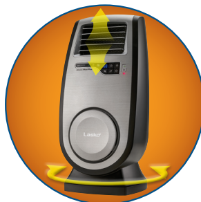
Power Controlled Louvers Independent or Combined Use plus Widespread Oscillation