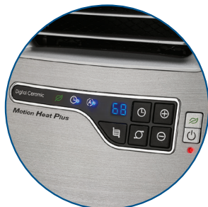
Digital Controls Adjustable Thermostat 8-Hour Auto Shut-Off Timers